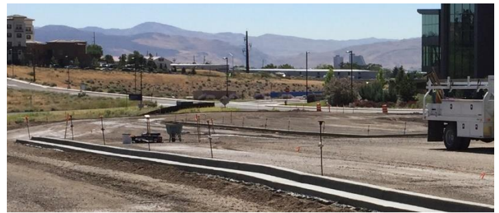
ENTERPRISE DR. PARKING LOT, UNR