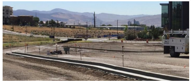
ENTERPRISE DR. PARKING LOT, UNR