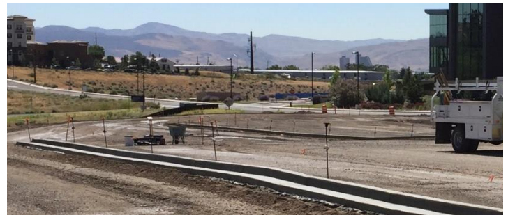
ENTERPRISE DR. PARKING LOT, UNR